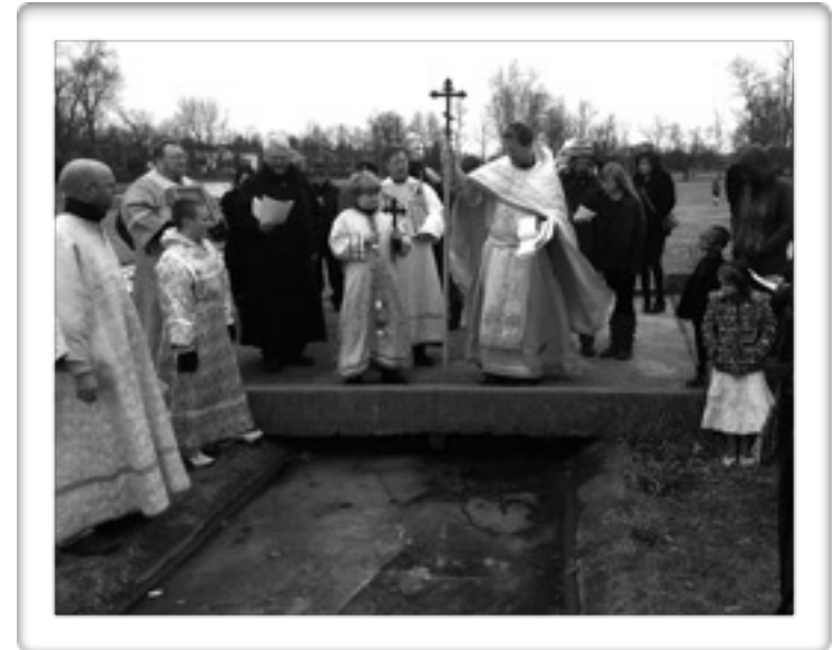
2015 Water Blessing at Lake Mingo

Today's Readings: Ephesians 4:7-13 Matthew 4:12-17