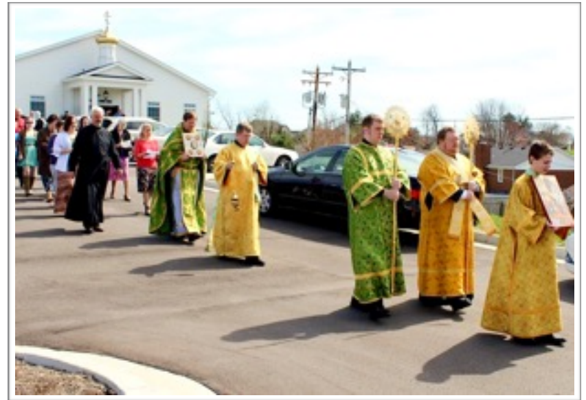
2015 Palm Sunday Procession

Today's Readings: Phillipians 4:4-9 John 12:1-18