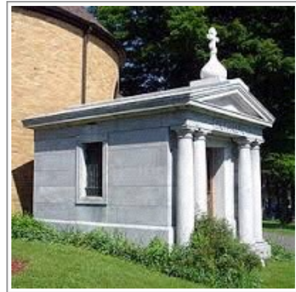
Tomb of St. Alexis Toth St. Tikhon Monastery, South Canaan, PA

Today's Readings: Acts 9:32-42 John 5:1-15