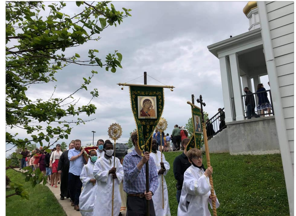
ANTIPASCHA Procession Last Weekend

Sunday of the Holy Myrrhbearing Women — Sunday, May 16, 2021