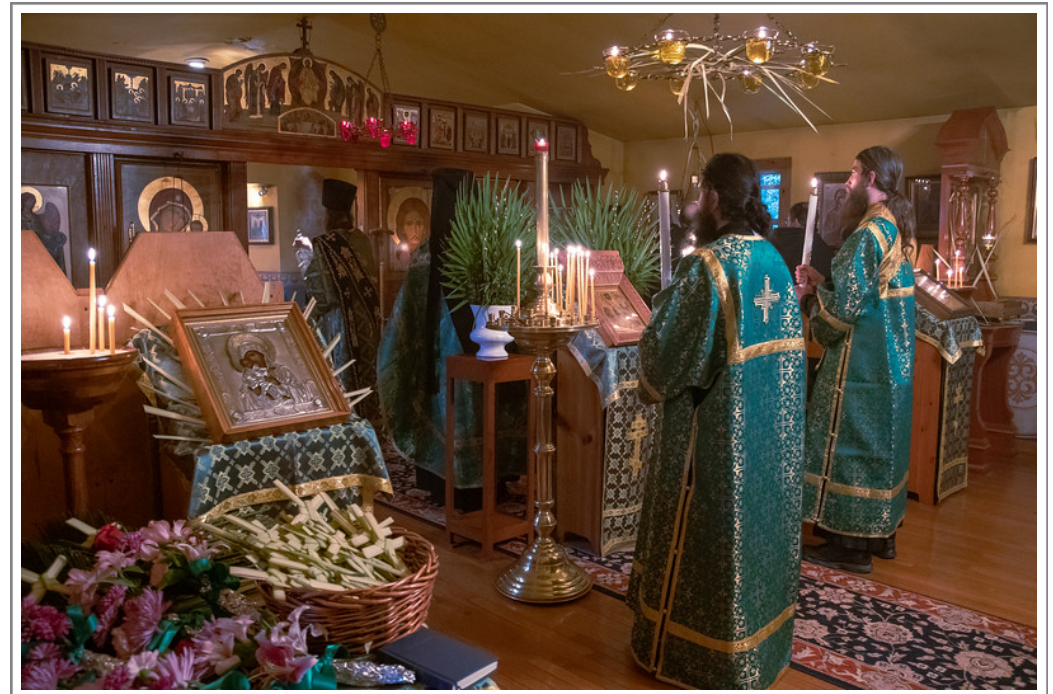
Palm Sunday 2021 Holy Cross Monastery