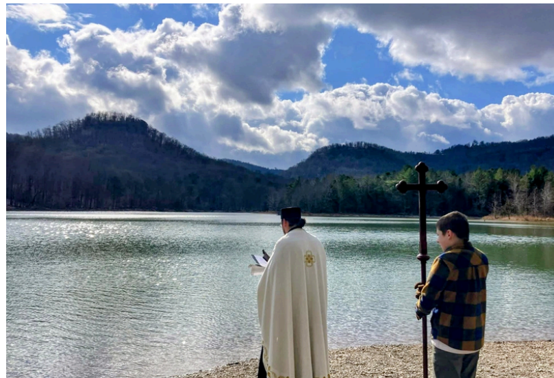
St. Nina had their community's first Water Blessing last Sunday at Owsley Fork Reservoir in Berea.